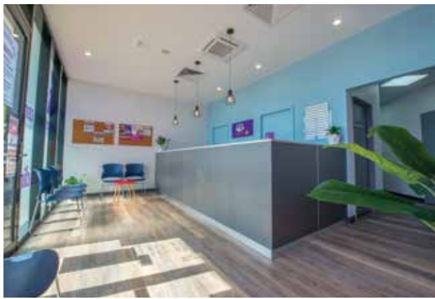
Ark Medical Centre, Coolalinga.