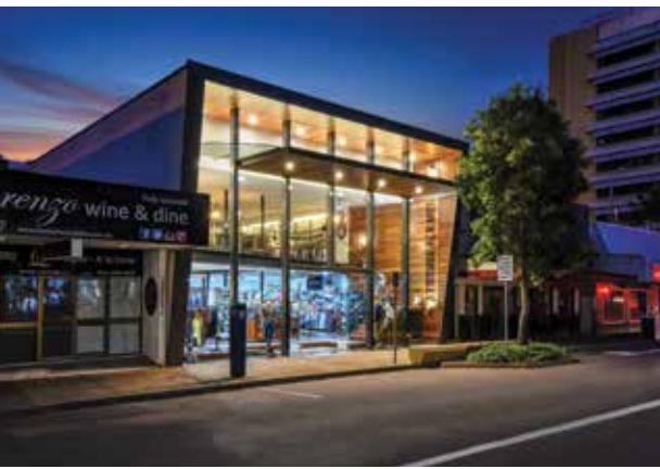
Attitude for Men.

Turn your dream project into reality with Ashford Group Architects. Call to book an appointment on Ph: 8941 7552 or visit www.ashfordarchitects.com.au