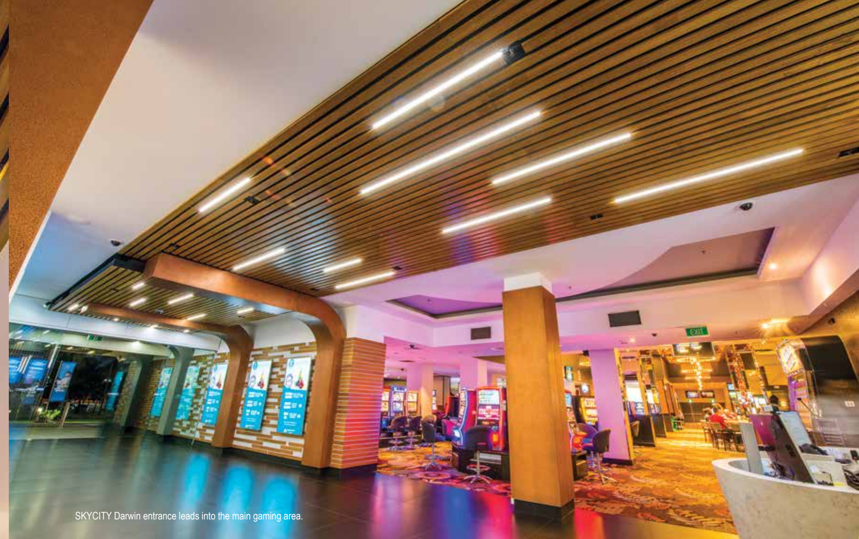
SKYCITY Darwin entrance leads into the main gaming area.