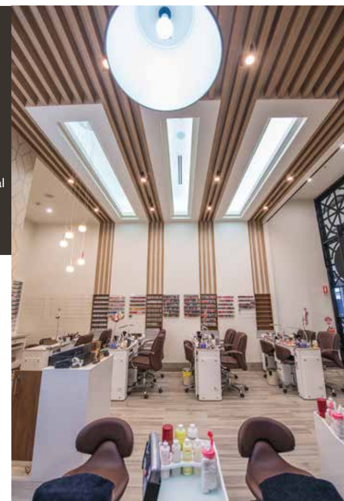
TD Nails & Spa at the new Gateway Shopping Centre.