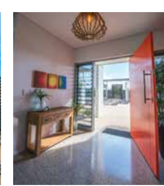
RESIDENT APP resident magazine.com.au 179