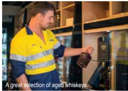
A great selection of aged whiskeys.