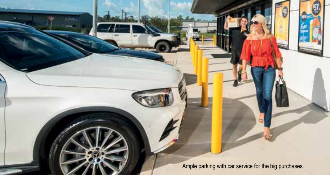
Ample parking with car service for the big purchases.