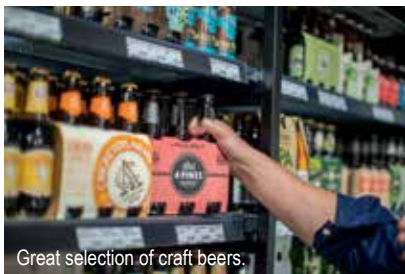
Great selection of craft beers.

The Territory finally has its first liquor superstore. Cellarbrations Superstore at Pinelands is located outbound on the Stuart Highway between Berrimah and Palmerston and provides the most convenient liquor shopping experience in the NT.