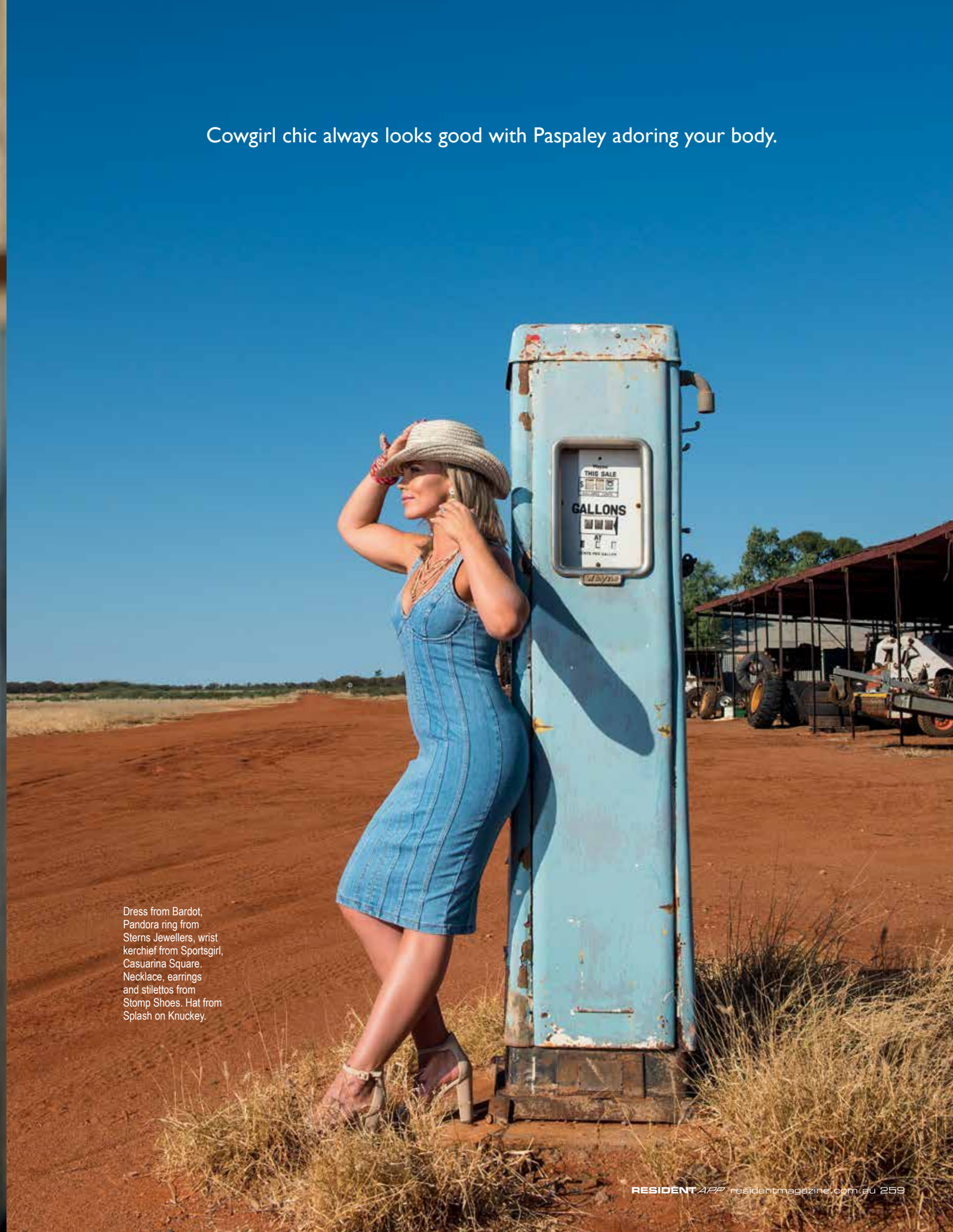
Dress from Bardot, Pandora ring from Sterns Jewellers, wrist kerchief from Sportsgirl, Casuarina Square. Necklace, earrings and stilettos from Stomp Shoes. Hat from Splash on Knuckey.

Cowgirl chic always looks good with Paspaley adoring your body.