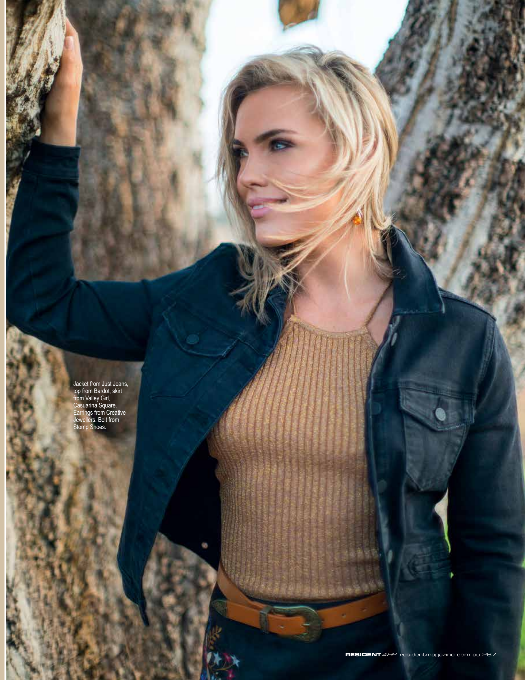
Jacket from Just Jeans, top from Bardot, skirt from Valley Girl, Casuarina Square. Earrings from Creative Jewellers. Belt from Stomp Shoes.