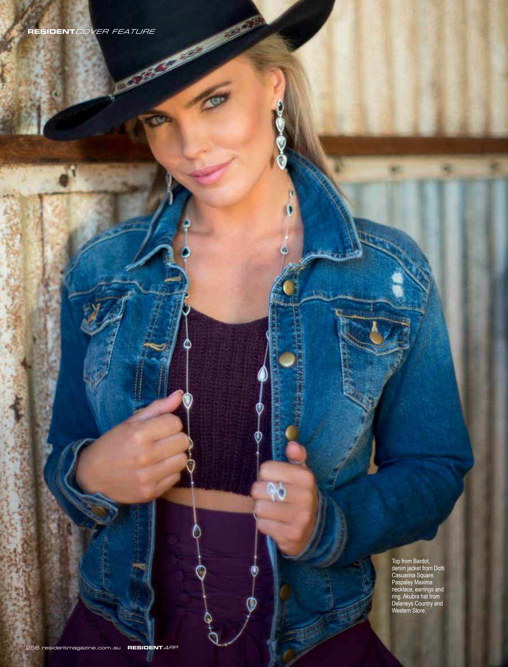
Top from Bardot, denim jacket from Dotti Casuarina Square. Paspaley Maxima necklace, earrings and ring. Akubra hat from Delaneys Country and Western Store.

Cowgirl chic always looks good with Paspaley adoring your body.