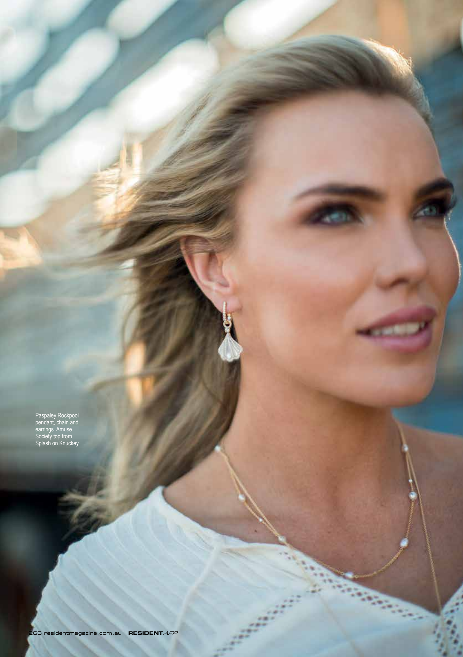
Paspaley Rockpool pendant, chain and earrings. Amuse Society top from Splash on Knuckey.