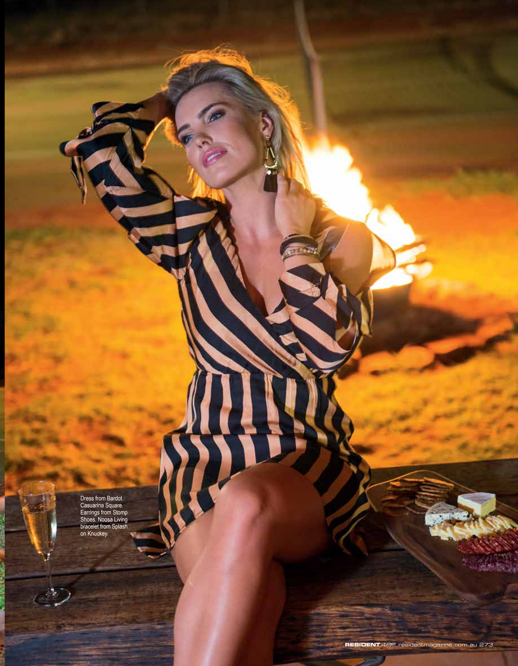
Dress from Bardot Casuarina Square. Earrings from Stomp Shoes. Noosa Living bracelet from Splash on Knuckey.