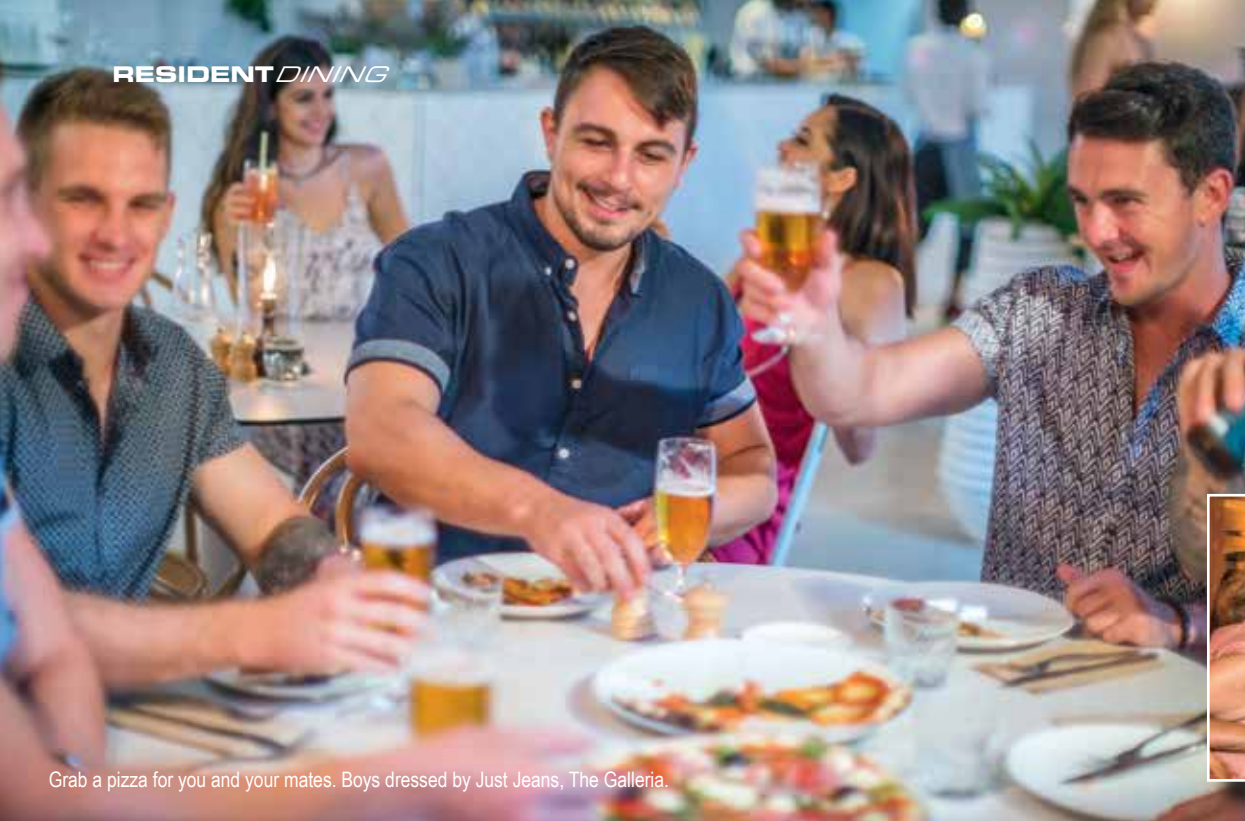
Grab a pizza for you and your mates. Boys dressed by Just Jeans, The Galleria.