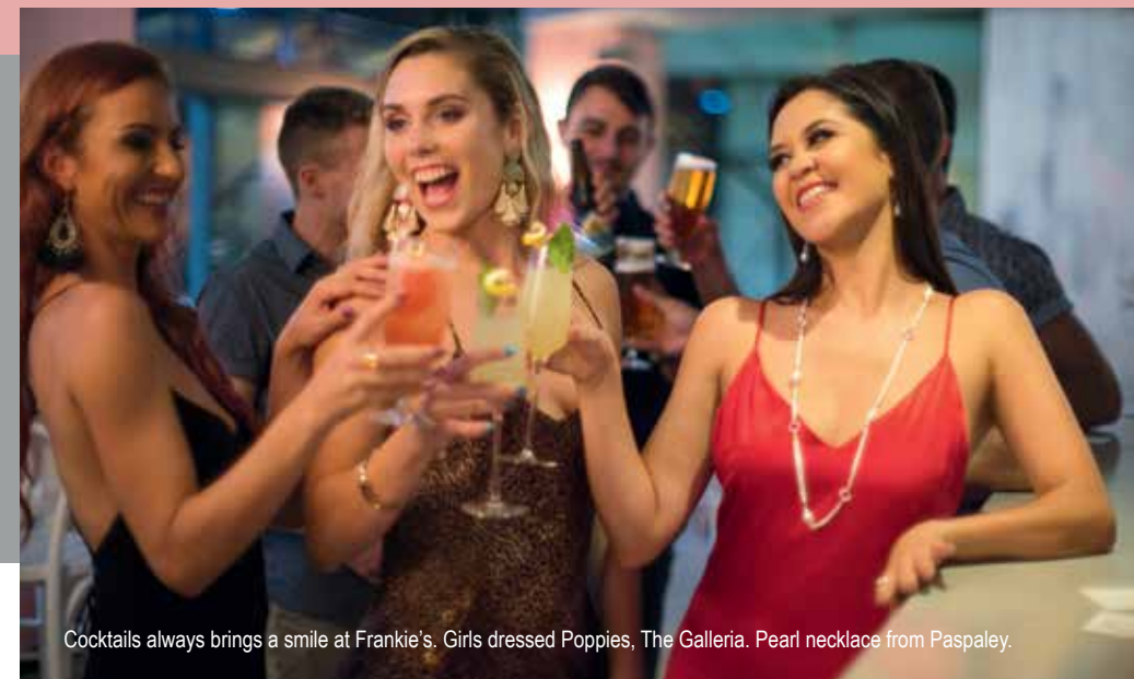
Cocktails always brings a smile at Frankie's. Girls dressed Poppies, The Galleria. Pearl necklace from Paspaley.