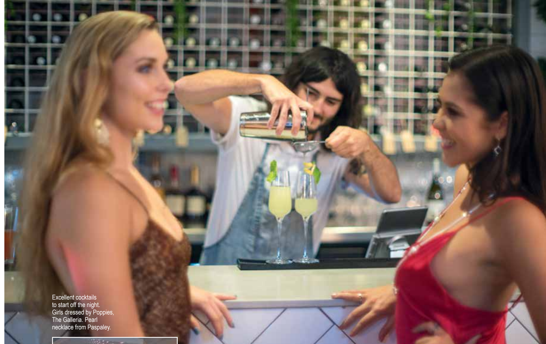
Excellent cocktails to start off the night. Girls dressed by Poppies, The Galleria. Pearl necklace from Paspaley.