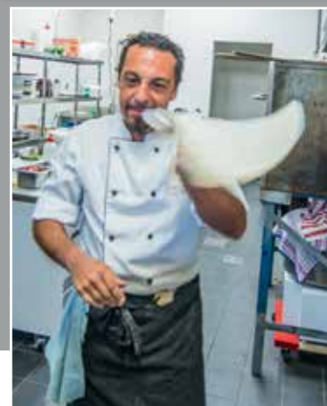
Hand-made pizzas made fresh everyday.