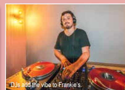
DJs add the vibe to Frankie's.