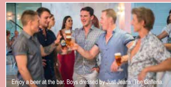
Enjoy a beer at the bar. Boys dressed by Just Jeans, The Galleria.