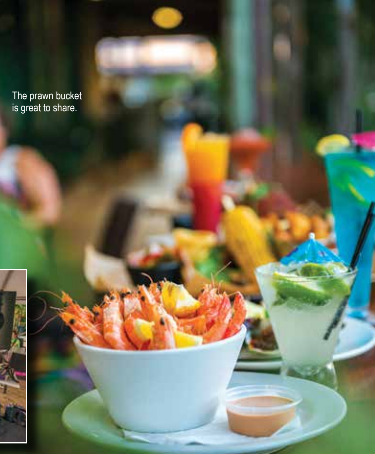
The prawn bucket is great to share.