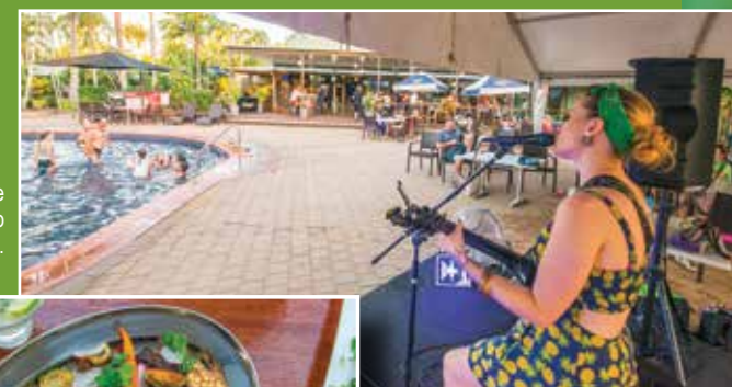
Afternoon live entertainment adds to the atmosphere.