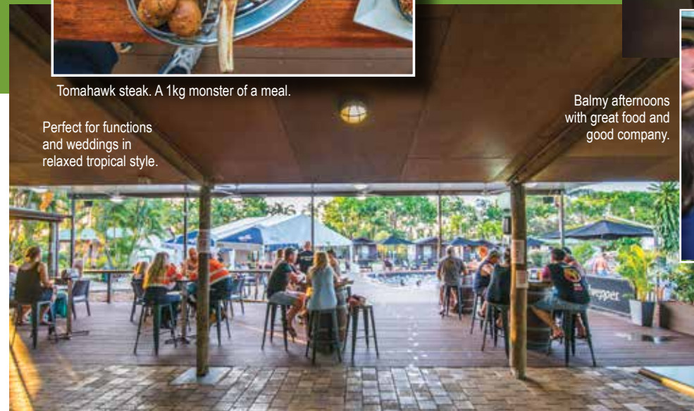
Balmy afternoons with great food and good company.