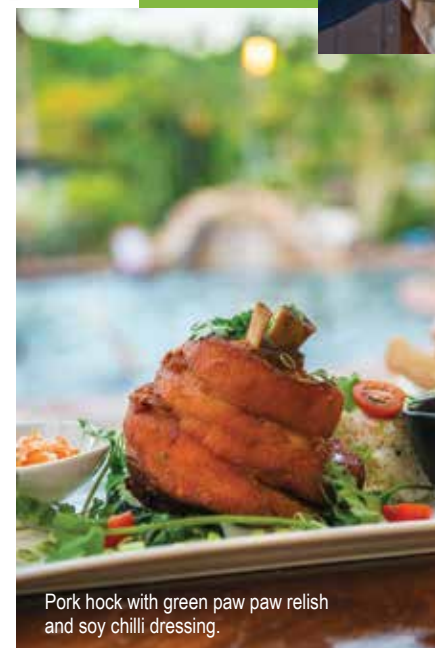
Pork hock with green paw paw relish and soy chilli dressing.