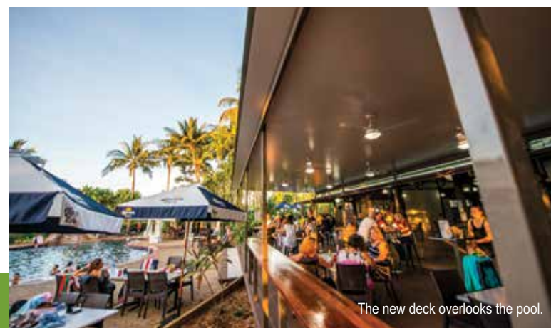
The new deck overlooks the pool.