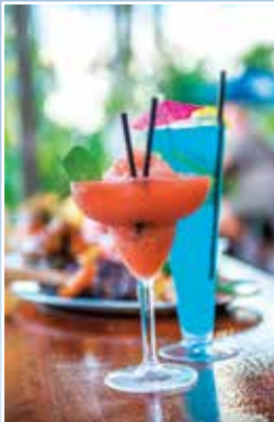
Great cocktails to complete the day.

Enjoy poolside dining at its best at Darwin FreeSpirit Resort. A new deck extension at Elements Poolside Bar and Bistro has extended the perfect space for al fresco dining.