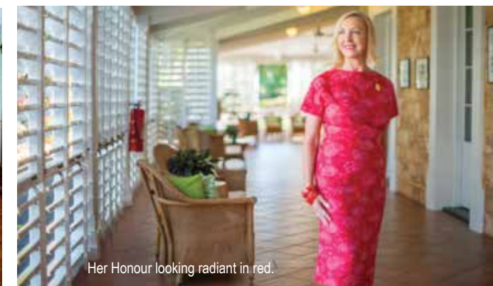
Her Honour looking radiant in red.

At Government House on Darwin's Esplanade, he was hosted in the Prince of Wales Room, named in his honour after he and Diana, Princess of Wales stayed in the same room, then a bedroom, 30 years ago during their bicentennial visit to Australia. The Prince of Wales Room is now a sitting room adjoining The Drawing Room, which is the main reception room and is used for various events hosted by the Administrator to showcase Territory hospitality and produce. The Drawing Room is the oldest room in Government House, surviving the bombing of Darwin and many cyclones. 'His Royal Highness remembered the room and loved its diversity, function and presentation now,' said Her Honour. 'He was impressed with how beautiful and grand the building still is, how it has been meticulously maintained and any modifications have been respectful of its heritage and origins.' All modifications and acquisitions for rooms at Government House are undertaken and guided