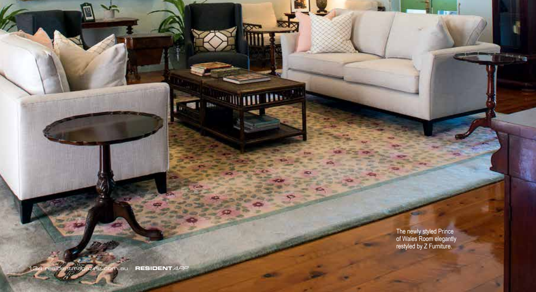
The newly styled Prince of Wales Room elegantly restyled by Z Furniture.