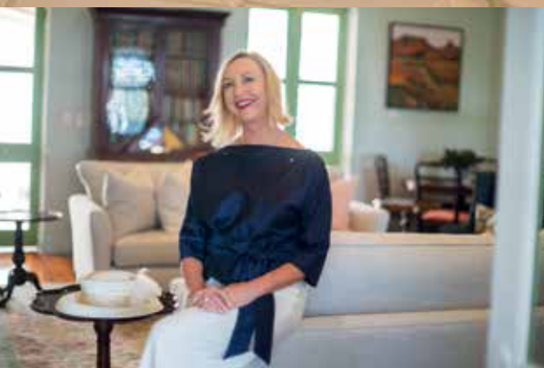
Her Honour enjoying the newly styled Prince of Wales Room.