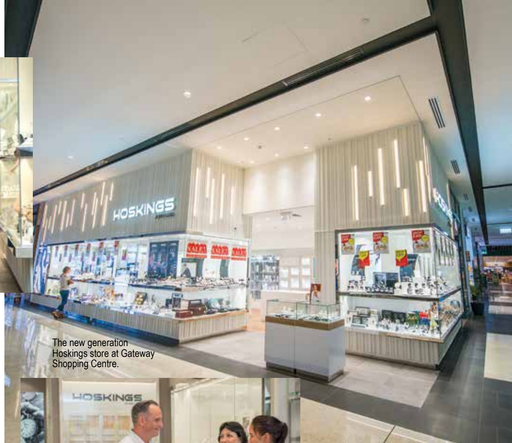
The new generation Hoskings store at Gateway Shopping Centre.