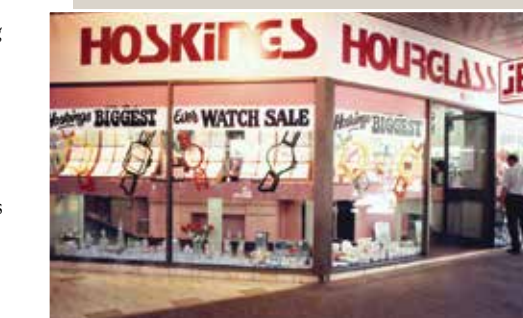
Hoskings first Darwin store in the 1980s.

Our staff are like family. We are extremely privileged that two have been with us for the thirty years and others for twenty years