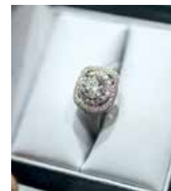
White gold double halo pink sapphire and diamond ring totaling ¾ of a carat.