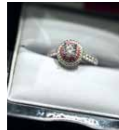
White gold double halo ring, with a one carat principal diamond, totaling 1¼ carats.