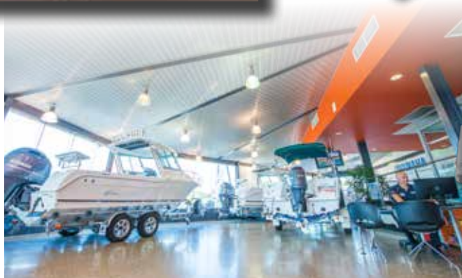
Darwin's premier air-conditioned showroom.