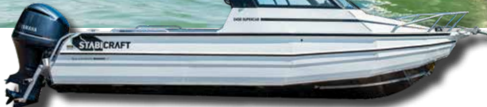
Adventure with confidence, In and Outboard Marine - Darwin's home of Stabicraft boats.

WE'RE RENOWNED FOR OUR BACK UP AND HIGH-QUALITY SERVICE FOR EVERYTHING WE SELL. OUR STAFF ARE PASSIONATE BOATING ENTHUSIASTS AND LOVE GETTING ON THE WATER AS MUCH AS OUR CLIENTS.