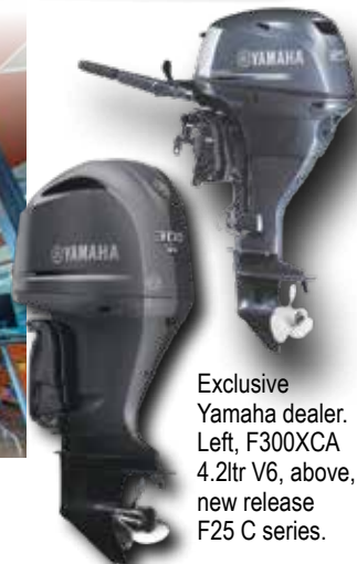
Exclusive Yamaha dealer. Left, F300XCA 4.2ltr V6, above, new release F25 C series.