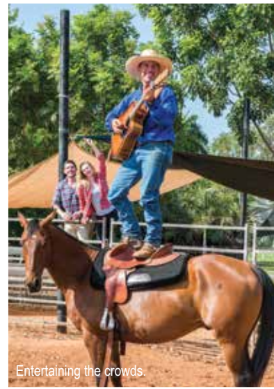
Entertaining the crowds.