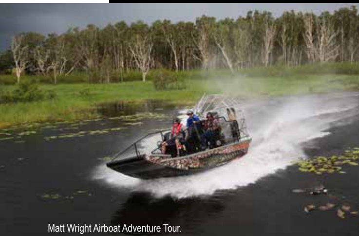
Matt Wright Airboat Adventure Tour.