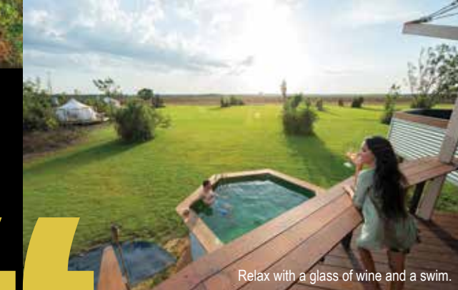
Relax with a glass of wine and a swim.

“ I LOVE SEEING INNOVATION AND NEW EXPERIENCES IN THE TOP END. IT REALLY IS THE FINAL FRONTIER WITH CHARACTER LIKE NOTHING ELSE AND ENDLESS OPPORTUNITIES FOR EXPLORING, WE JUST NEED TO GET MORE PEOPLE OVER HERE TO CHECK IT OUT!