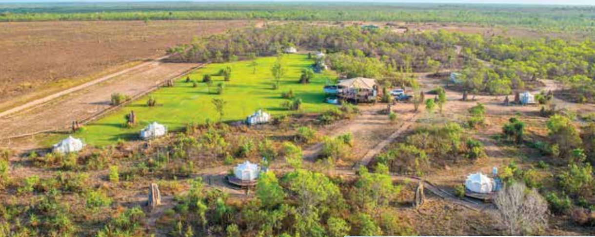
Matt Wright Outback Safari Glamping Adventure.