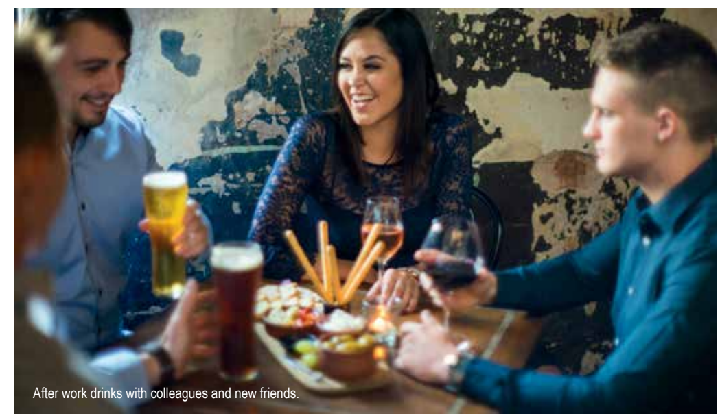
Girls dressed by Sarah Lyn Lingerie and Fashion Boutique. Boys dressed by Connor, Casuarina Square.