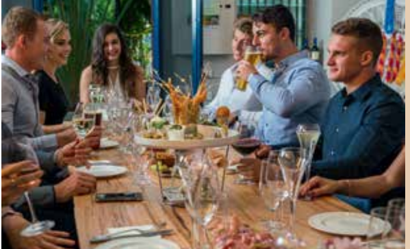
Take your corporate function to the next level in the private Salty Plum Room. From cheese boards to delivered meals from Little Miss Korea, why not include a wine tasting to complete your most memorable meeting ever.