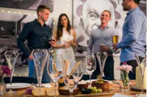
Enjoy a tasting as an elegant meeting break in the Salty Plum Room.