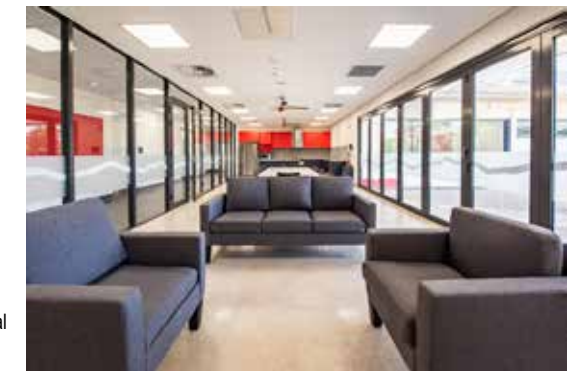
Floor to ceiling Internal glazed walls allows natural light to penetrate to the centre of the building.

The landscape layout design replicates nearby Nitmiluk Gorge. Soft and hard materials add to the sense of place.