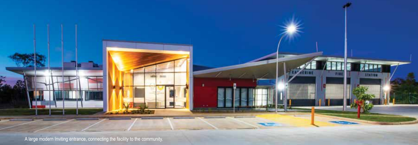
A large modern inviting entrance, connecting the facility to the community.

Opened in April and designed by Darwin's Ashford Group Architects, Katherine's impressive new fire and emergency services facility sits alongside the Katherine Ambulance Station, which opened last July.