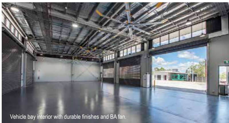
Vehicle bay interior with durable finishes and BA fan.