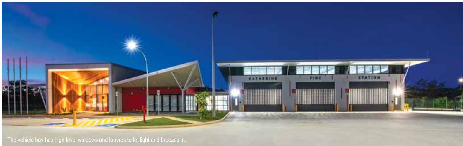
The vehicle bay has high level windows and louvres to let light and breezes in.