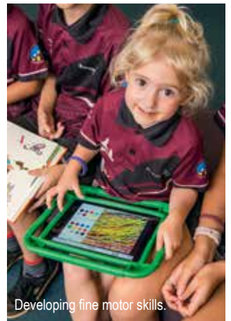
Developing fine motor skills.