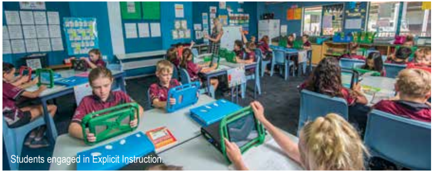
Students engaged in Explicit Instruction.