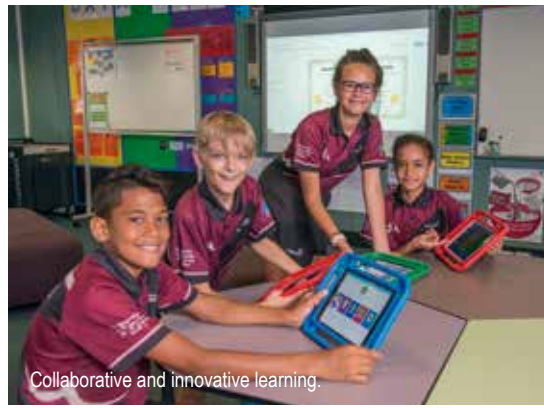
Collaborative and innovative learning.