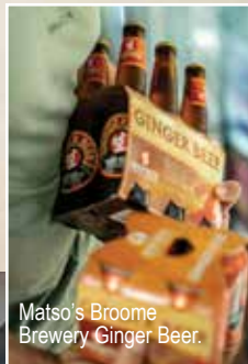
Matso's Broome Brewery Ginger Beer.