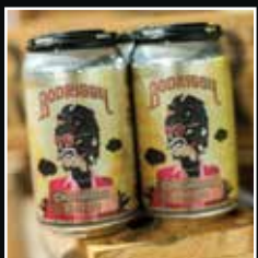
Chuckaboo White IPA.