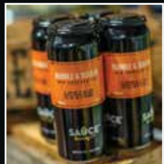
New England IPA.