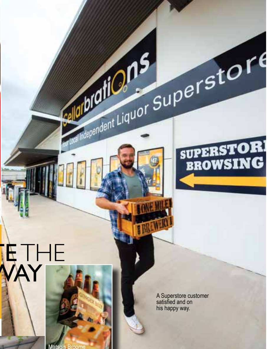
A Superstore customer satisfied and on his happy way.