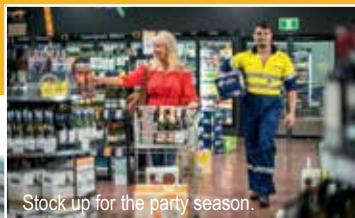
Stock up for the party season.