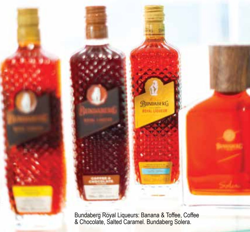
Bundaberg Royal Liqueurs: Banana & Toffee, Coffee & Chocolate, Salted Caramel. Bundaberg Solera.