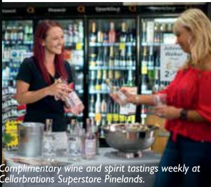
Complimentary wine and spirit tastings weekly at Cellarbrations Superstore Pinelands.

Located outbound on the Stuart Highway between Berrimah and Palmerston, Cellarbrations Superstore Pinelands not only has a colossal four-lane, high-access, drive-through bottle shop that fits your boat and trailer - there's also an enormous, state-of-the-art, air-conditioned retail store with loads of parking. Territory owned and operated, Cellarbrations Superstore is the most convenient liquor shopping experience in the NT.