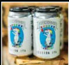
Specky Juice Session IPA.