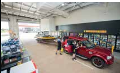
The quick and easy drive-thru service.