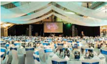
The very glamorous Sparkle Ball at Mindil Beach Casino & Resort.