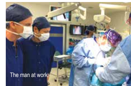
The man at work.