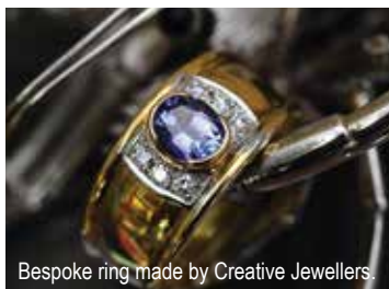
Bespoke ring made by Creative Jewellers.