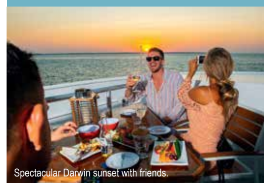
Spectacular Darwin sunset with friends.