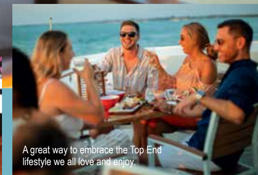
A great way to embrace the Top End lifestyle we all love and enjoy.