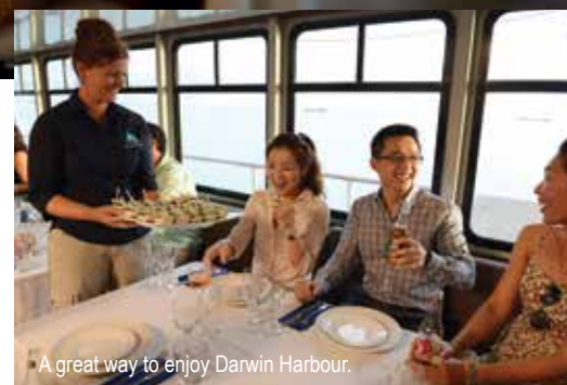
A great way to enjoy Darwin Harbour.

The Charles Darwin caters for weddings, charters and private functions for up to 60, 120 or 270 passengers over the three decks. Contact Darwin Harbour Cruises to discuss the range of options for your next event 7 Stokes Hill Rd, Darwin City NT. Ph: 8942 3131