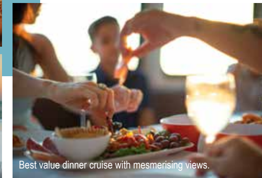
Best value dinner cruise with mesmerising views.