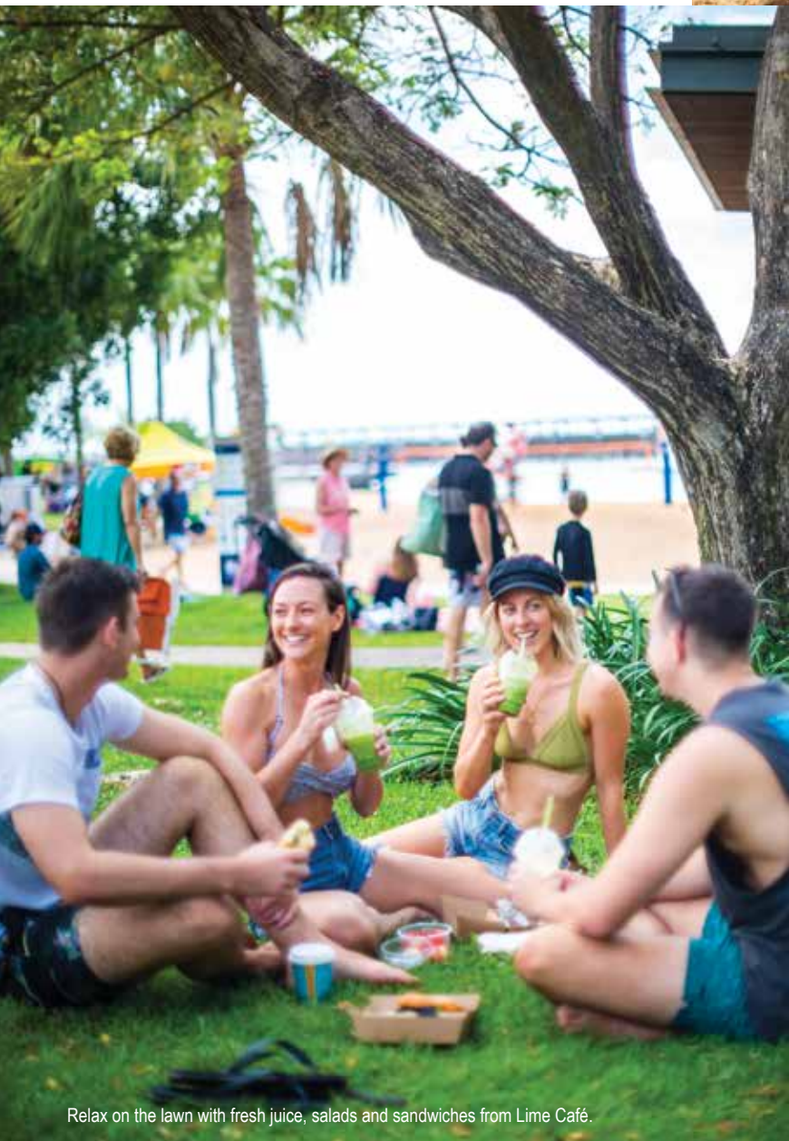
Relax on the lawn with fresh juice, salads and sandwiches from Lime Café.

The network of walkways, boardwalks and decks allows people to walk, ride or jog between land and water, spanning both the new and historical areas. Soak up the views, find the perfect souvenir or enjoy time-out with friends.