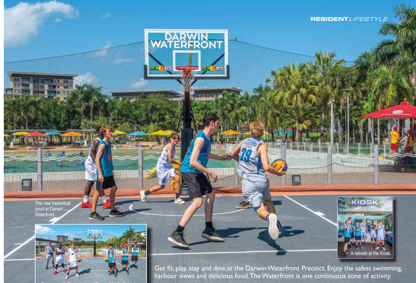
The new basketball court at Darwin Waterfront.