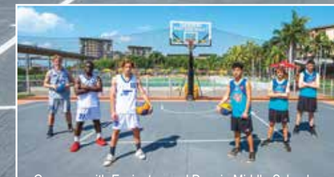
Game on with Essington and Darwin Middle School.