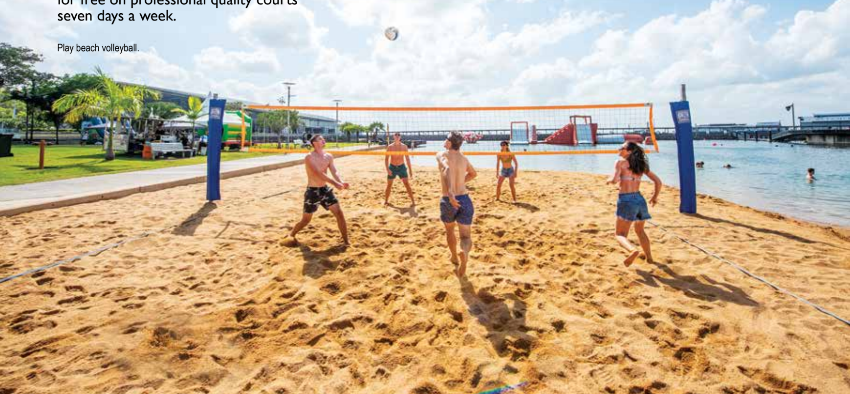
Play beach volleyball.

If you're an aficionado of basketball or beach volleyball, you'll be delighted with the choice of activity areas at Darwin's Waterfront Precinct where you can meet friends, have fun and get fit. The new full-size volleyball court on the new Recreation Lagoon beach provides a free facility for locals and visitors while also promoting a healthy and active lifestyle. Anyone can play, you don't even have to know each other. That's half the fun! Volley and basketballs are available from the lifeguards on duty from 9am to 6pm daily, or players can bring their own ball. Cradled on the harbourside of historic Stokes Hill Wharf, the Darwin Waterfront Precinct is just a five-minute walk from the city centre, and people spend time here walking, jogging, bike riding, swimming and exercising. The beach volleyball court and new 3X3 basketball court add another option to get active in one of Darwin's most beautiful outdoor areas. These new healthy activities will increase physical fitness around the city. The family-friendly, activity-packed Recreation Lagoon, beach and Wave Lagoon also draw people to the Waterfront Precinct, providing the perfect way to cool off after a good game or two.