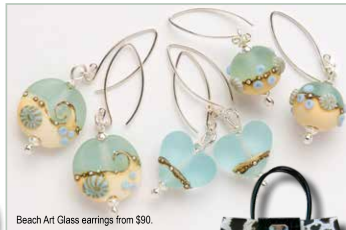
Beach Art Glass earrings from $90.