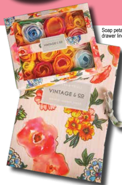
Soap petals and drawer liners $19.90 ea.

When you're stuck for a gift to buy, then head into How Sweet It Is. You will definitely find something special.