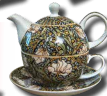
William Morris tea for one $40.