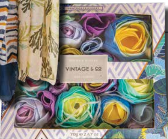
Silk scarves $30 ea.