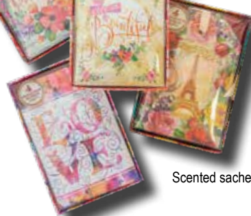
Scented sachets $10 ea.

Family owned and operated, How Sweet It Is at Jape Homemaker Village may look like ye olde-fashioned sweet shop from the outside, but while they do have the most delicious, mouth-watering chocolates, homemade fudges and traditional sweets inside, you'll also find a treasure trove of unique, affordable gifts, accessories and decorations for all ages and all occasions.