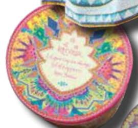
Intrinsic porcelain mugs $25 ea.