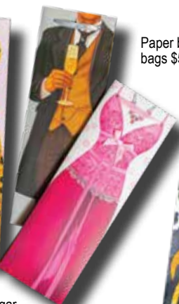
Paper bottle gift bags $5 ea.