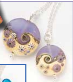
Above, left and bottom right: Beach Art Glass pendants from $90 ea.