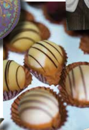
Australian handmade chocolates from $3 ea.