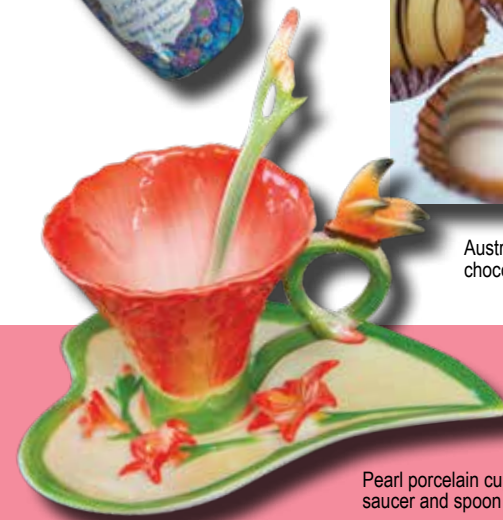
Pearl porcelain cup saucer and spoon $60.