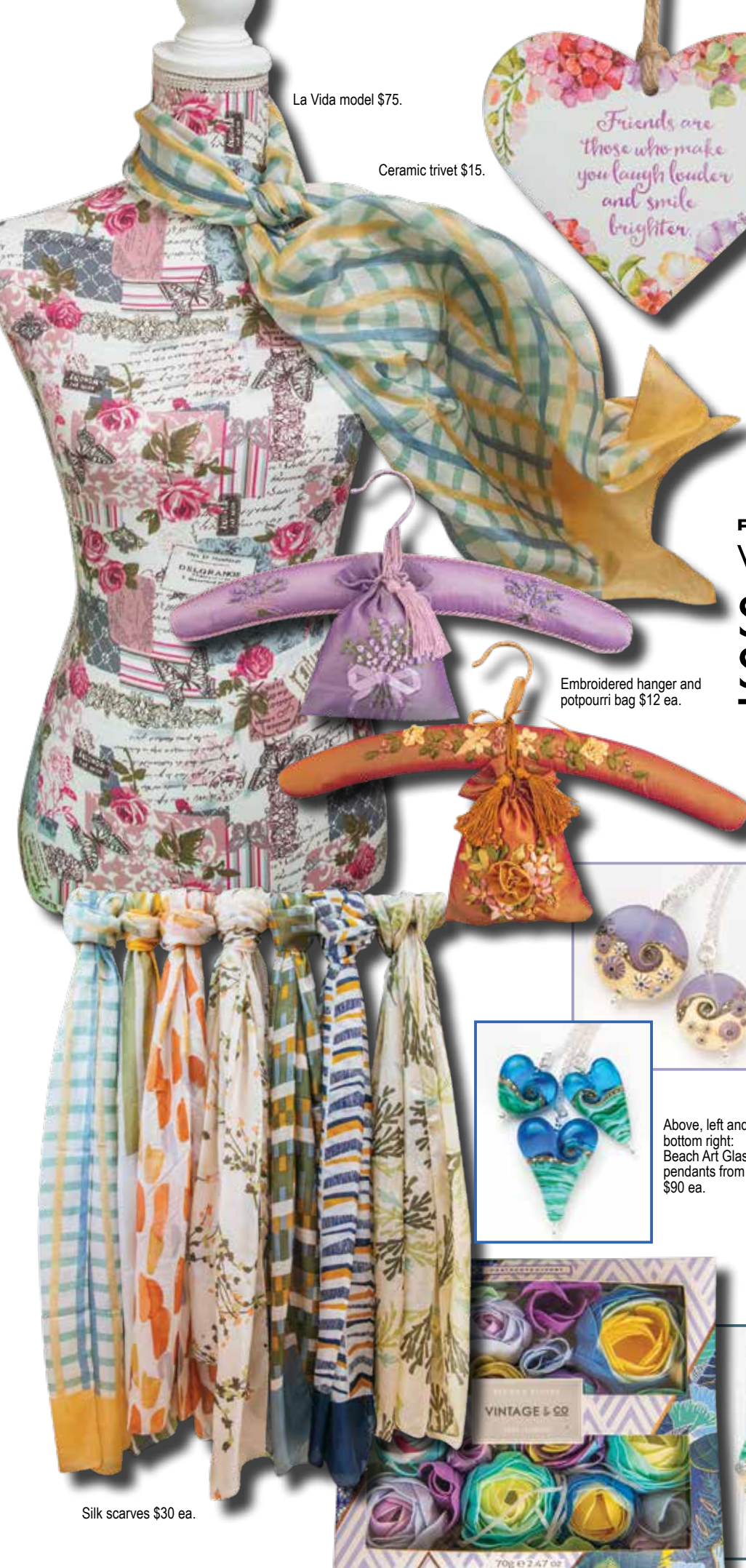
La Vida model $75.