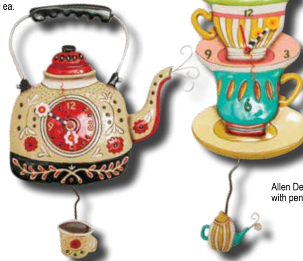
Allen Designs wall clocks with pendulum $88 ea.