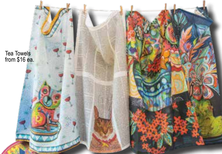
Tea Towels from $16 ea.