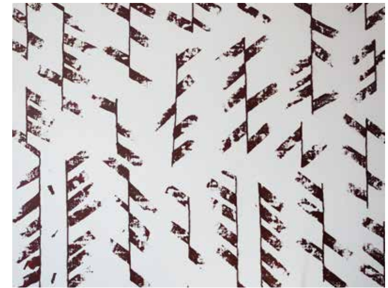
'Spat' is based on baby oysters growing in the hatchery.

From the spirit of the ocean and the lustre of pearl shells, pearl diver, prince of tides and marine scientist Julian Brown brings the light, energy, movement and colour in his surroundings to life in his first collection of paintings. 'Iridescent' reflects his unique view of the light and water movements playing above the lines, pearl shells and oyster beds.