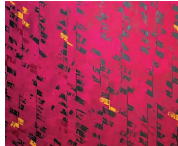
'Dragon Fruit' displays the fruits of the region.