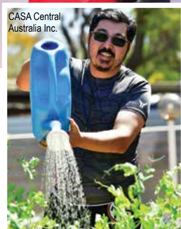
CASA Central Australia Inc.

NDS provides members with a strong voice, enabling the sector to initiate change collectively, influence outcomes and deliver the funding needed to ensure the best possible quality of life for people with disabilities.