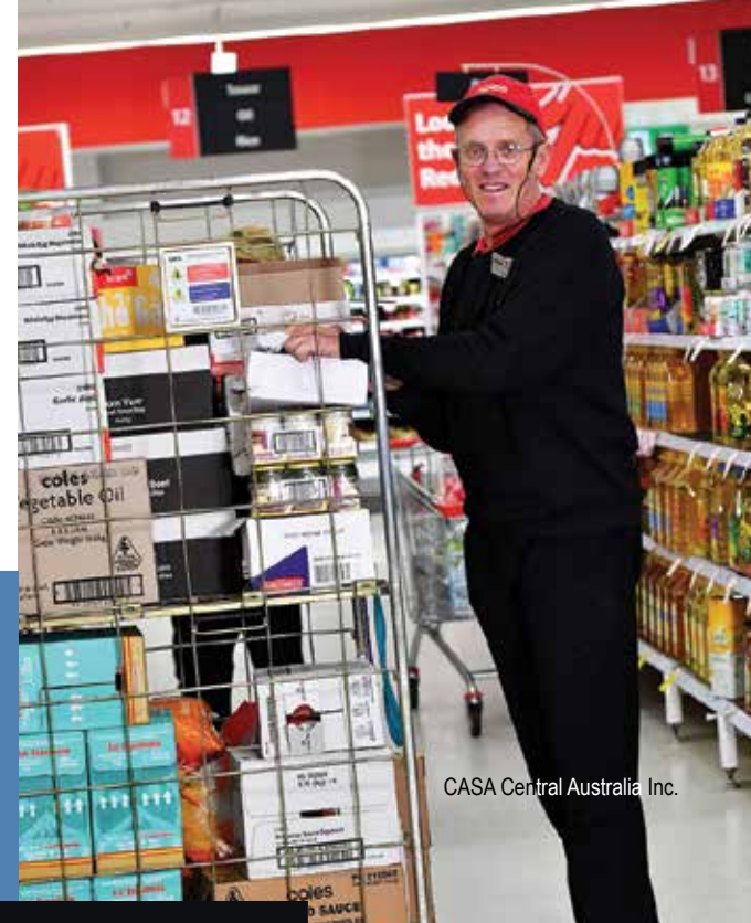
CASA Central Australia Inc.

NDS provides members with a strong voice, enabling the sector to initiate change collectively, influence outcomes and deliver the funding needed to ensure the best possible quality of life for people with disabilities.