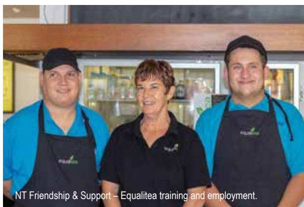
NT Friendship & Support – Equalitea training and employment.