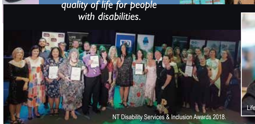
NT Disability Services & Inclusion Awards 2018.