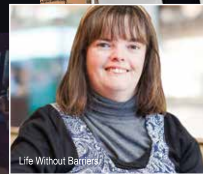
Life Without Barriers