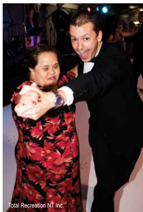
Total Recreation NT Inc.