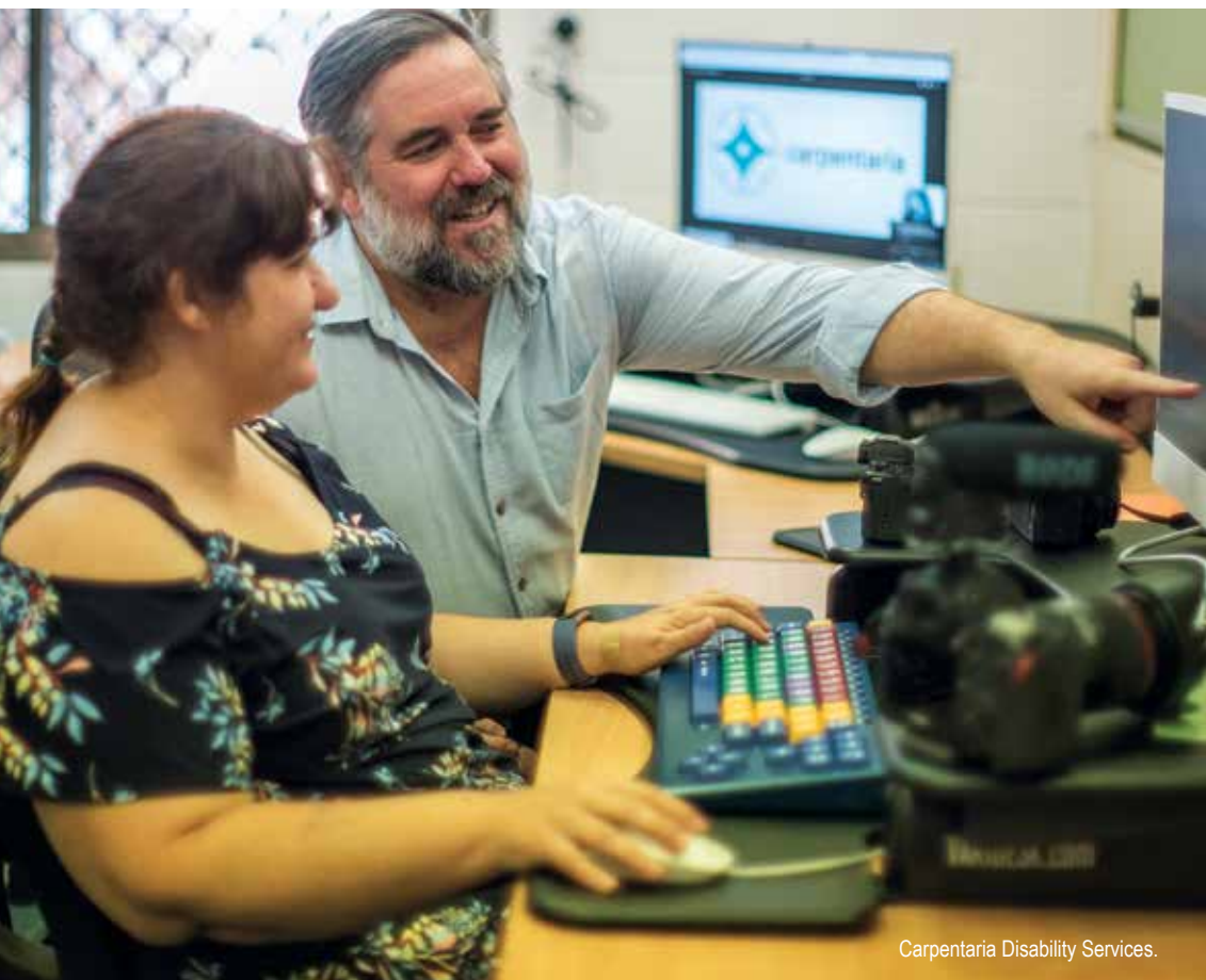
Carpentaria Disability Services.