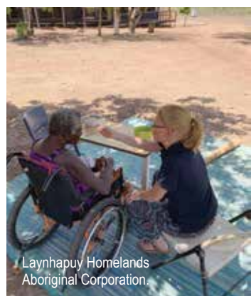
Laynhapuy Homelands Aboriginal Corporation.