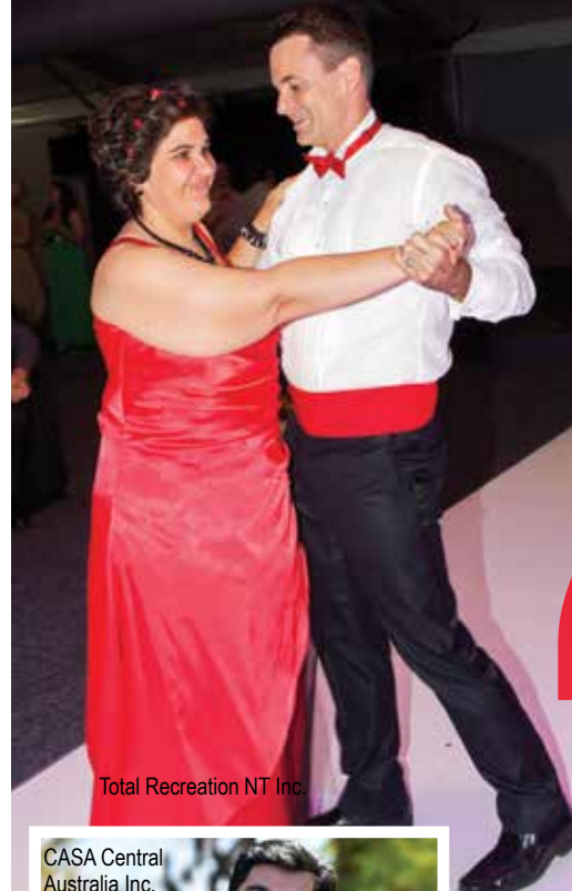
Total Recreation NT Inc.