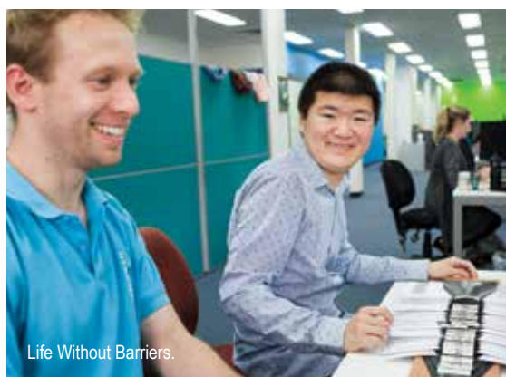
Life Without Barriers.