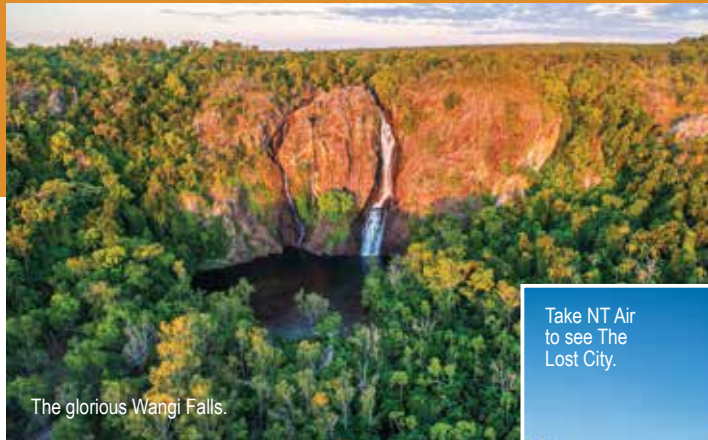
The glorious Wangi Falls.

Just a 90-minute drive from Darwin, Litchfield National Park is the Top End's most popular attraction. With many ways to experience the diversity of its stunning waterfalls, swimming holes, giant termite mounds, wildlife, monsoon rainforests and historical sites, few compare with a whirl in a helicopter over this a natural wonder.