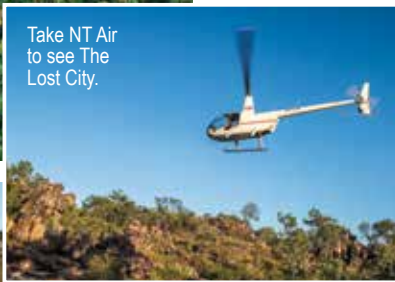
Take NT Air to see The Lost City.