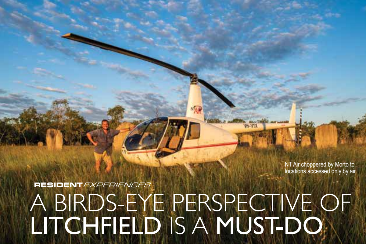
NT Air choppered by Morto to locations accessed only by air.