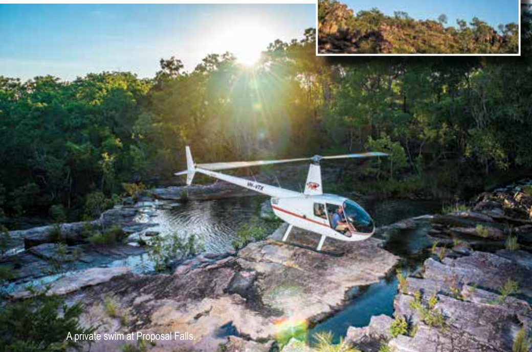
A private swim at Proposal Falls.