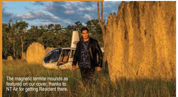
The magnetic termite mounds as featured on our cover, thanks to NT Air for getting Resident there.