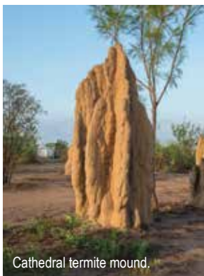
Cathedral termite mound.