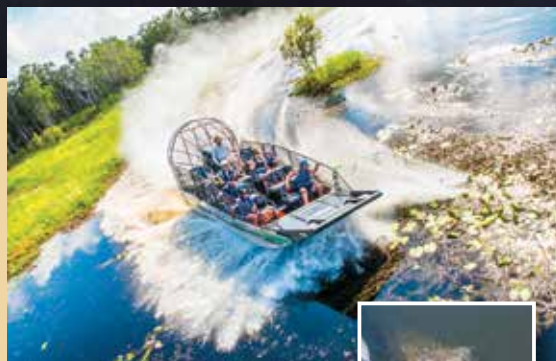
Thrilling air-boat ride on the floodplains.

There is an 'Ultimate Tour' perfect for you with Outback Floatplane Adventures.