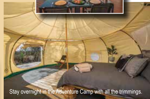
Stay overnight in the Adventure Camp with all the trimmings.