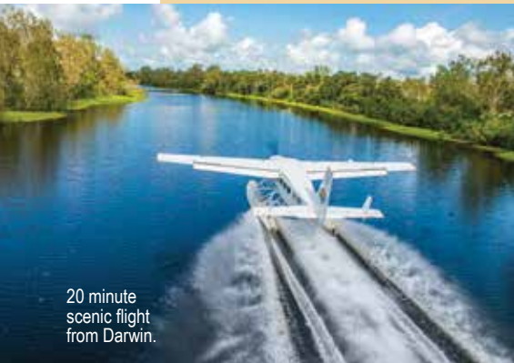
20 minute scenic flight from Darwin.

Luxury and adventure are not typically associated with a Northern Territory outback tour — but it's precisely what's on offer with Outback Floatplane Adventures.