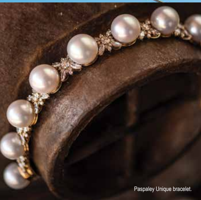
Paspaley Unique bracelet.