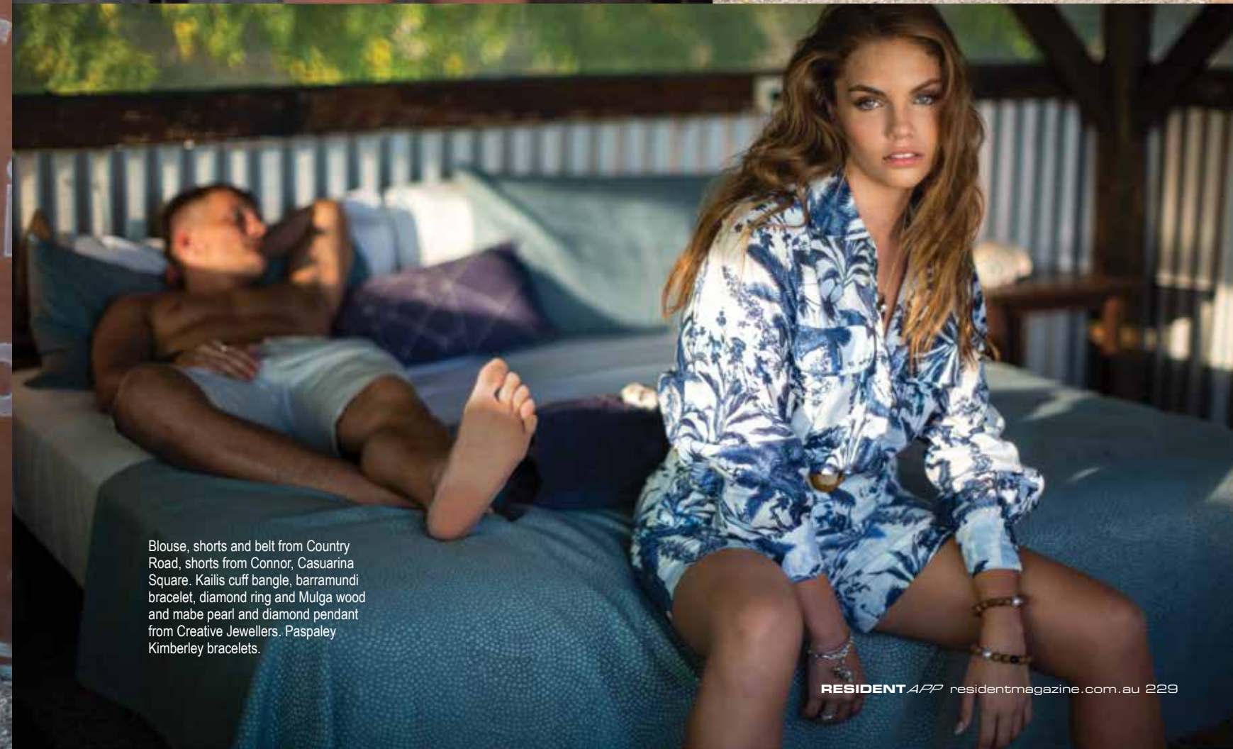
Blouse, shorts and belt from Country Road, shorts from Connor, Casuarina Square. Kallis cuff bangle, barramundi bracelet, diamond ring and Mulga wood and mabe pearl and diamond pendant from Creative Jewellers. Paspaley Kimberley bracelets.