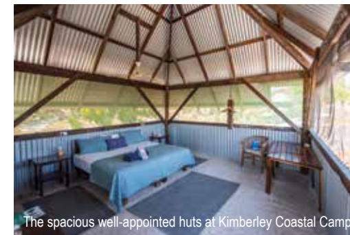
The spacious well-appointed huts at Kimberley Coastal Camp.