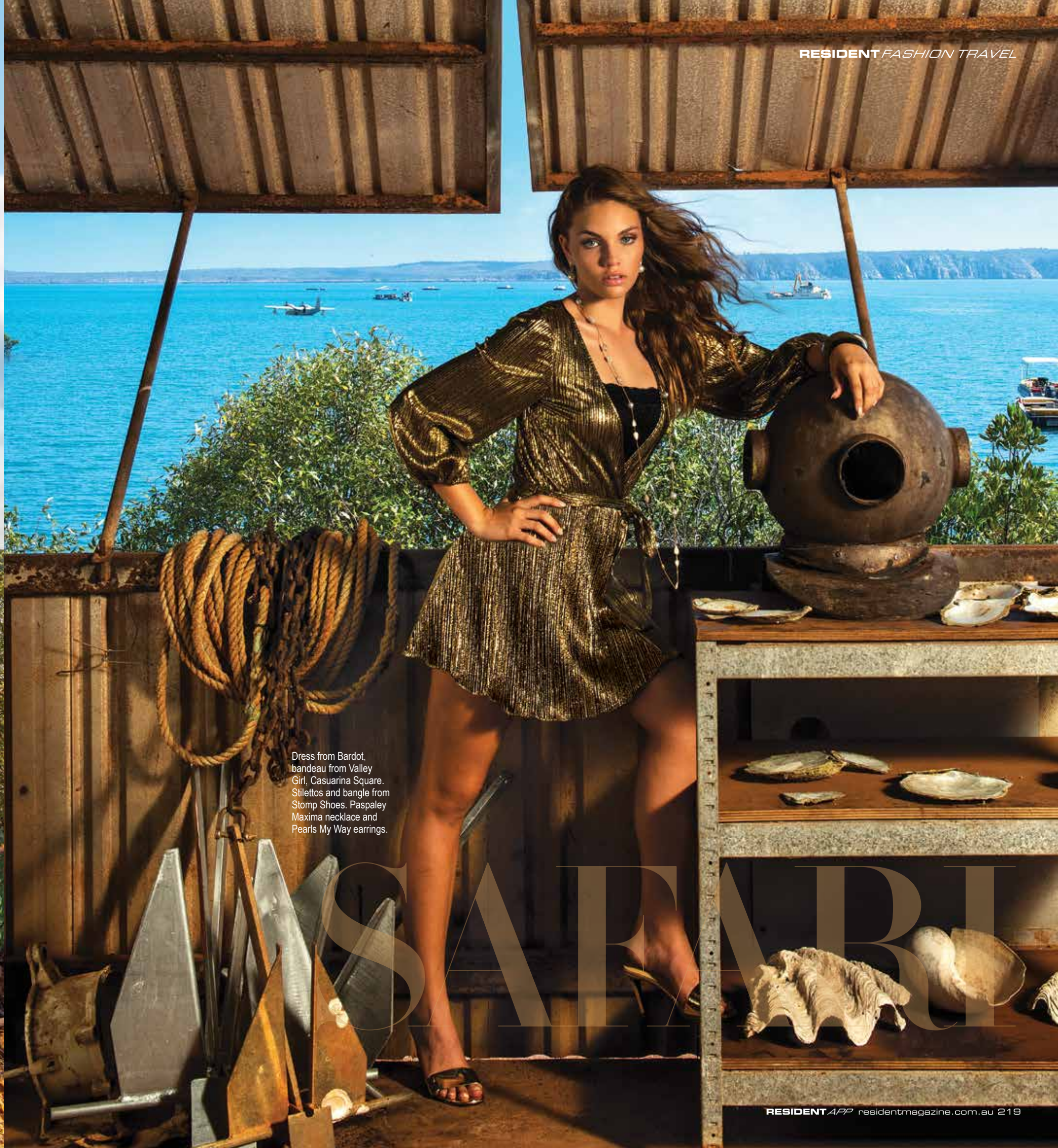
Dress from Bardot, bandeau from Valley Girl, Casuarina Square. Stilettoes and bangle from Stomp Shoes. Paspaley Maxima necklace and Pearls My Way earrings.