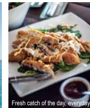
Fresh catch of the day, everyday.