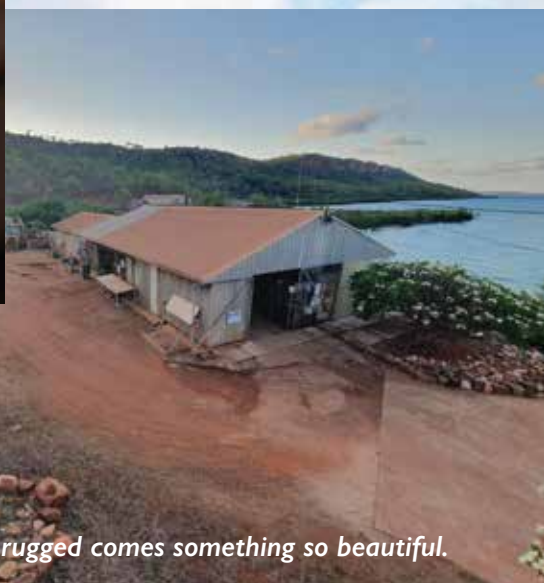
From somewhere so rugged comes something so beautiful.