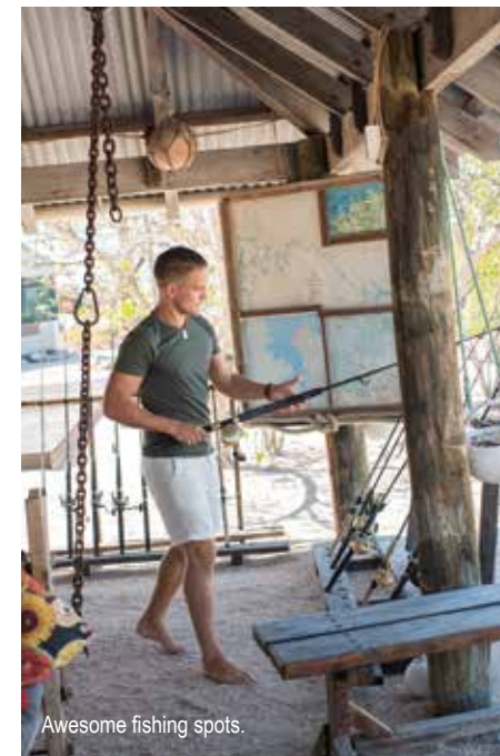
Awesome fishing spots.