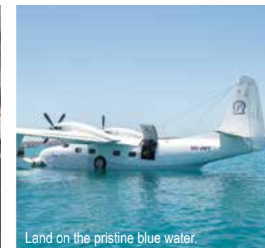
Land on the pristine blue water.