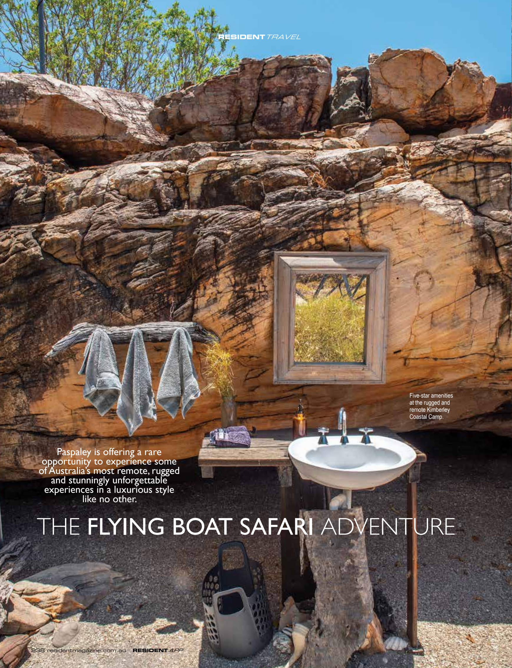
Five-star amenities at the rugged and remote Kimberley Coastal Camp.

Paspaley is offering a rare opportunity to experience some of Australia's most remote, rugged and stunningly unforgettable experiences in a luxurious style like no other.