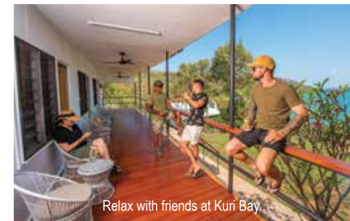
Relax with friends at Kuri Bay.