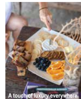
A touch of luxury everywhere.