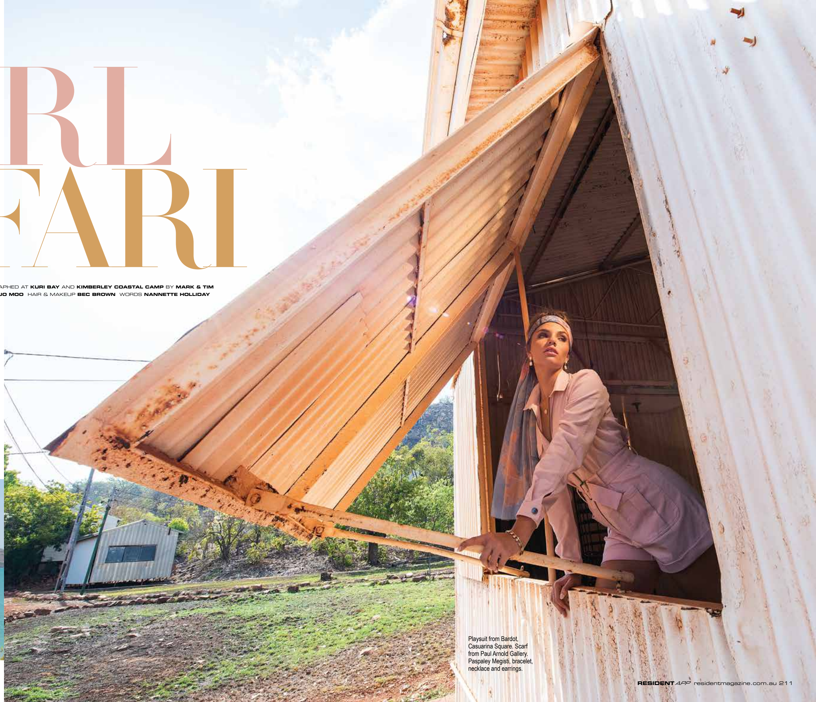
Playsuit from Bardot, Casuarina Square. Scarf from Paul Arnold Gallery, Paspaley Megisti, bracelet, necklace and earrings.