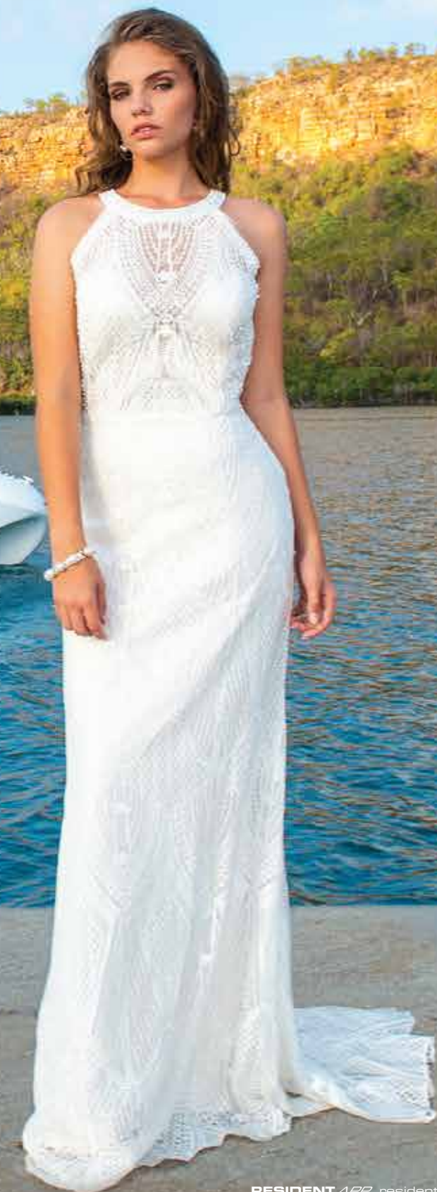
Gown from The Big Day, Paspaley Unique Bracelet, and Monsoon earrings.