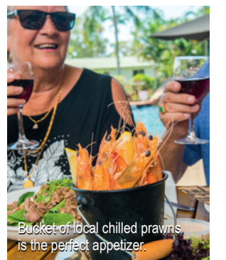
Bucket of local chilled prawns is the perfect appetizer.