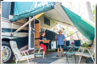
Home away from home.