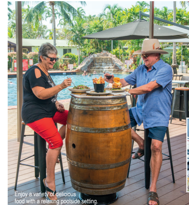
Enjoy a variety of delicious food with a relaxing poolside setting.

Check in with the friendly team at FreeSpirit Resort today, 901 Stuart Hwy Holtze, Darwin. T: 8935 0888 E: bookings@darwinfreespiritresort.com.au www.darwinfreespiritresort.com.au