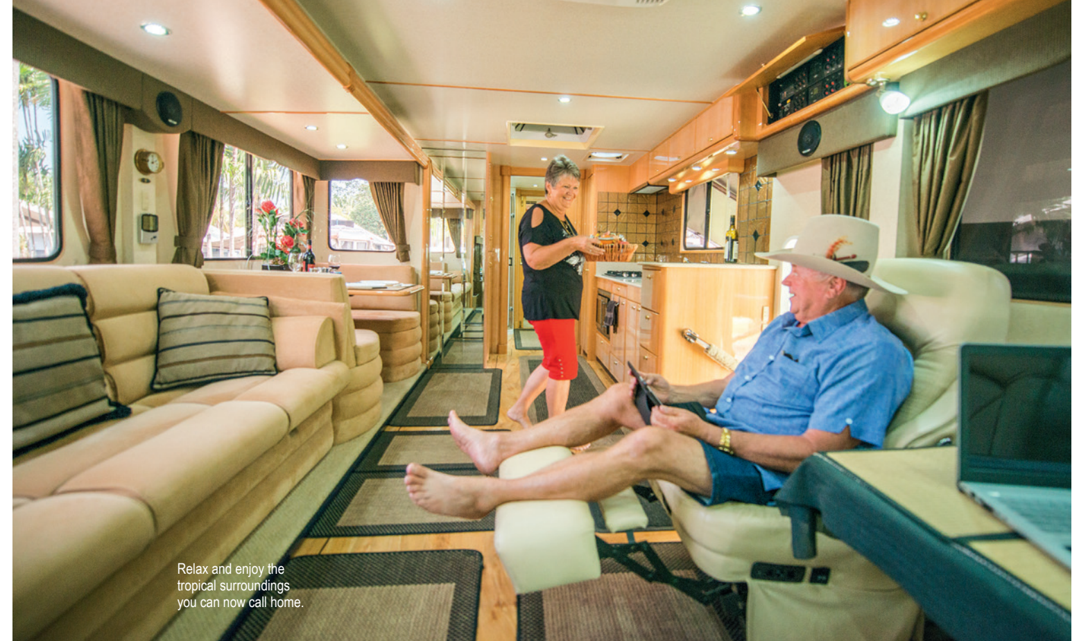
Relax and enjoy the tropical surroundings you can now call home.

WHERE ELSE WOULD YOU FIND THREE SWIMMING POOLS SURROUNDED BY TROPICAL GARDENS, NIGHTLY LIVE MUSIC AND SHOWS, A GREAT BAR, RESTAURANT AND OUTDOOR TERRACE OVERLOOKING THE LAGOON POOL AND WATERFALL.