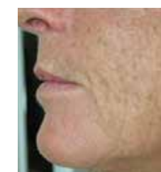
Fine lines after.