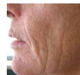
Fine lines before.