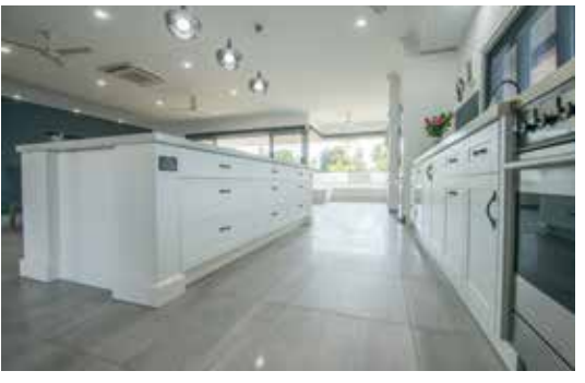
176 residentmagazine.com.au RESIDENT APP

Designing a functional modern kitchen can be difficult. We spend 12% of our lives in the kitchen, beaten only by the bedroom, so it's crucial the space works both practically and aesthetically for our lives.