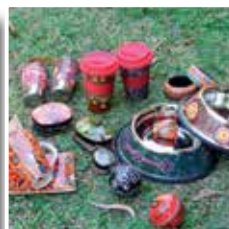
Better World Arts.