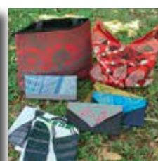
Injalak Arts products.