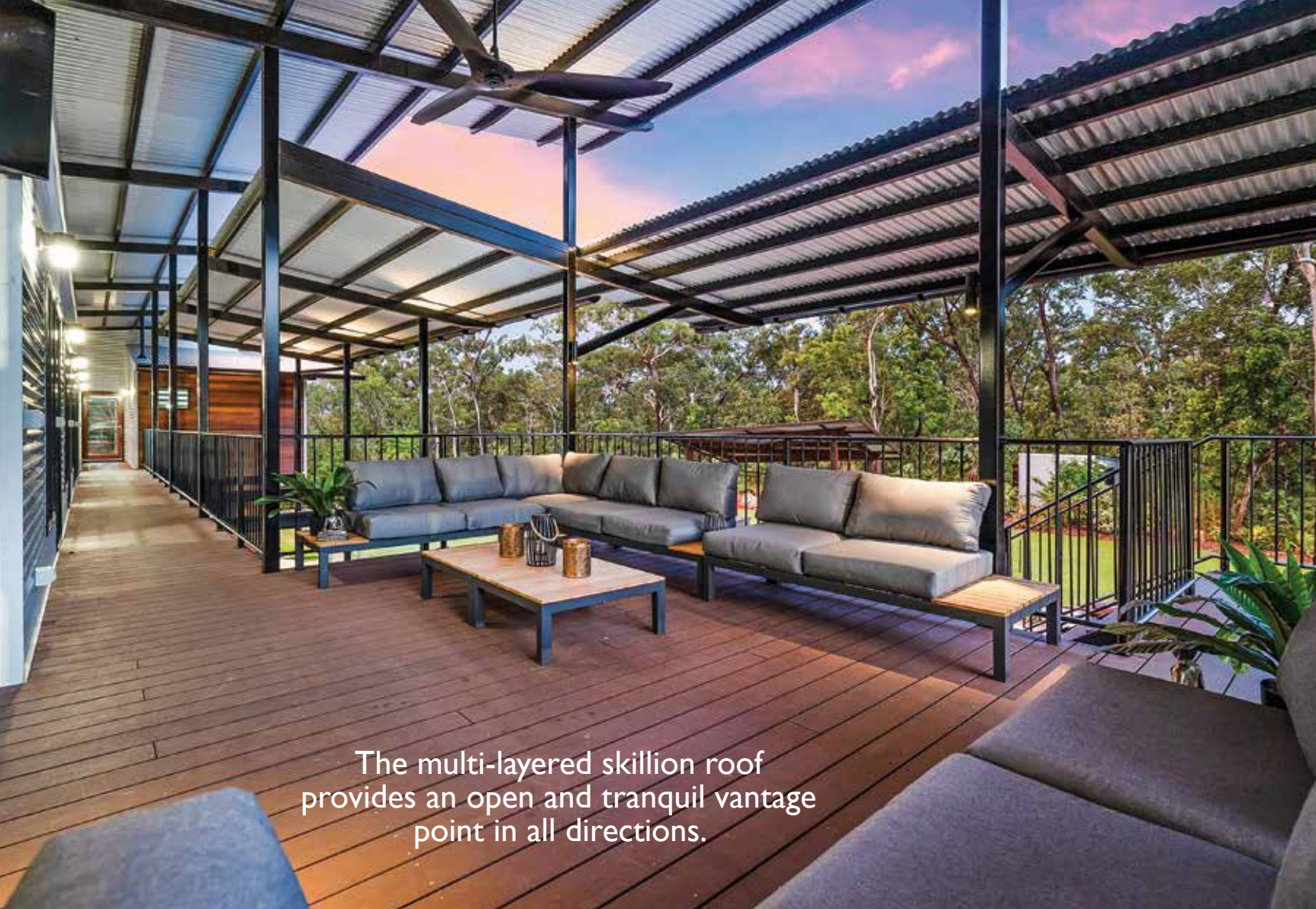
The multi-layered skillion roof provides an open and tranquil vantage point in all directions.