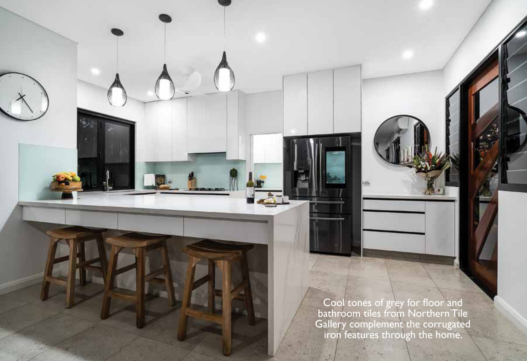
Cool tones of grey for floor and bathroom tiles from Northern Tile Gallery complement the corrugated iron features through the home.