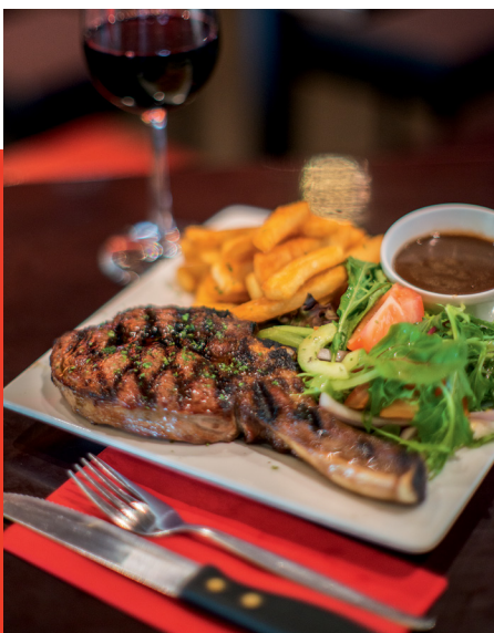
Rib eye on the bone with salad and chips.