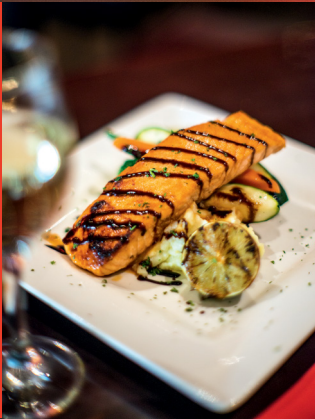
Baked Atlantic salmon, maple soy lime glaze, mash, vegetables.