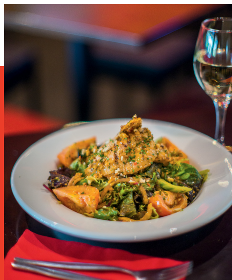
Chicken and cashew salad, tomato, onion, roasted cashew and mild chilli coriander dressing.

Indulge your sweet tooth with five delicious boozy milkshake flavours; Bubble Bum, Peanut Butter Bourbon, Choco Jaffa Nutella, Salted Caramel Bourbon and Coconut Rum.