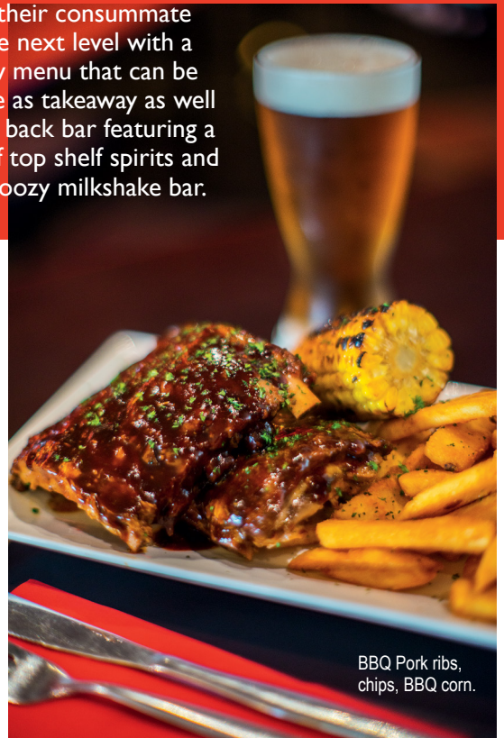
BBQ Pork ribs, chips, BBQ corn.