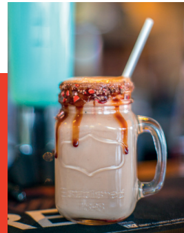
Choco jaffa boozy milkshake.

Never one to rest on their laurels, the multi-award winning Dollys Bar has taken their consummate offerings to the next level with a delectable new menu that can be ordered online as takeaway as well as a revamped back bar featuring a larger range of top shelf spirits and a brand new boozy milkshake bar.